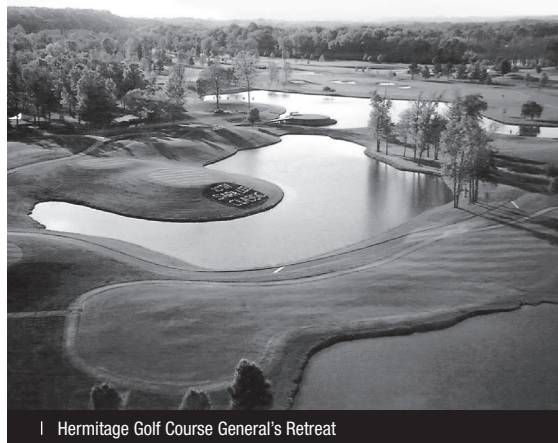
Hermitage Golf Course General's Retreat